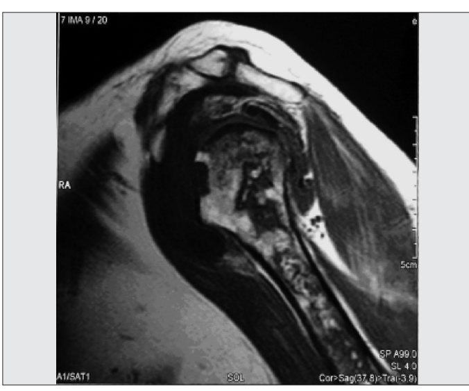
Figure 3. Sagittal T1 weighted image show extensive low signal abnormalities of the humeral epiphysis, metaphysis and diaphysis that indicate avscular necrosis.

cause of bone death. It is a rare complication in patients receiving chronic dialysis without any known risk factors, however, corticosteroid therapy is a major risk factor for increasing the development of osteonecrosis. It is difficult to predict which