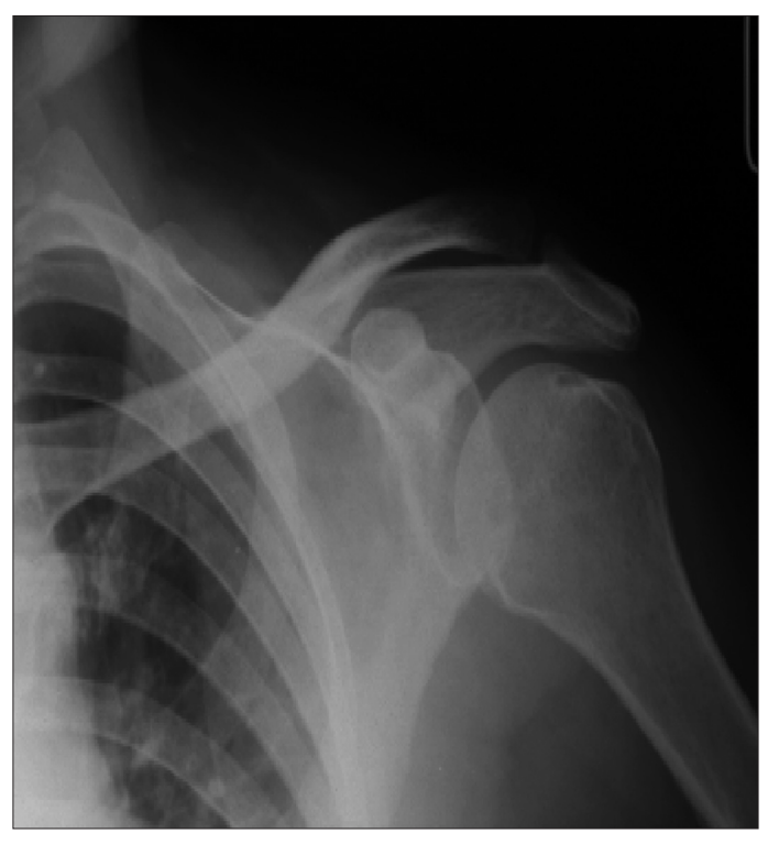
Figure 1. Radiograph of the left shoulder reveals subchondral cystic lesions in the humeral head.

Surgical intervention was planned and core decompression was carried out. The patient's shoulder pain relieved rapidly after surgery.