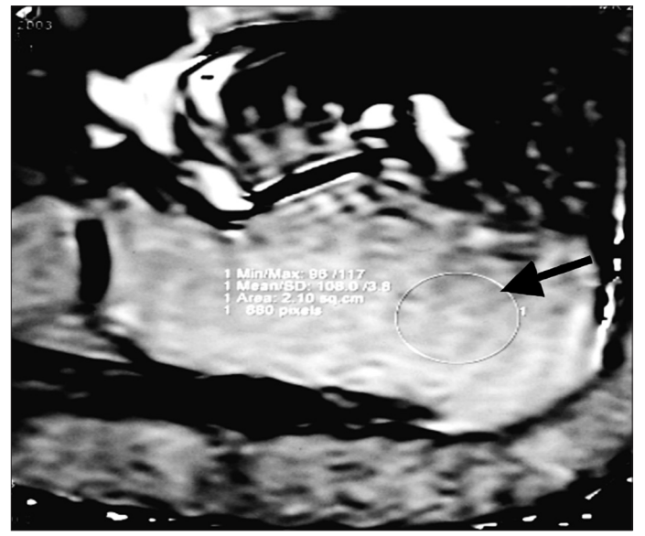
Figure 2. T2 RT map image: Calcaneus T2 RT measurement area.

Because of its complex physiopathology, osteoporosis is a clinical entity that still needs an acceptable, objective method for its definition, therapy and follow-up. Currently diagnostic assess-