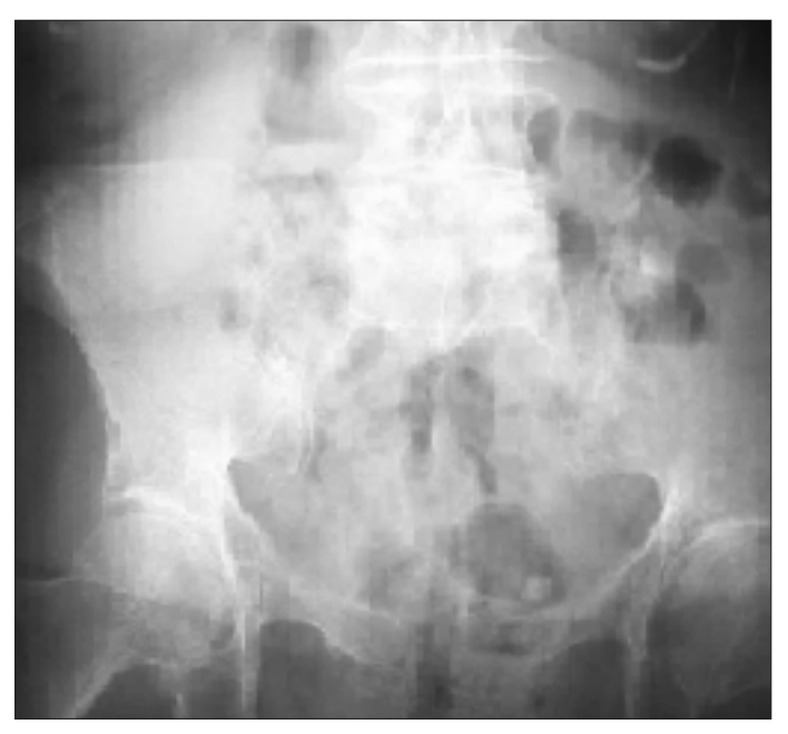
Figure 1. Plain anteroposterior radiograph of the pelvis with no obvious fracture line.

The patient was admitted to the inpatient rehabilitation unit with a diagnosis of SIF on the tenth day of symptoms, and was treated with subcutaneous salmon calcitonin (Tonocalcin<sup>®</sup>) 100