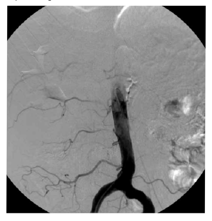
Figure 2. A conventional mesentery artery angiography showed an occlusion in the inferior mesentery artery.

surgery and was operated. The surgeon confirmed the large bowel perforation and performed left hemicolectomy with colostomia. Pathological examination of the resected bowel segment was as follows: diffuse mucosal hemorrhagic infarct, presence of multifocal ulceration, transmural hyperemia and edema, fibrinoid necrosis in the vessel walls, and perforation of the colon wall. After all these findings, the patient was diagnosed as having PAN, and corticosteroid (1 mg/kg/day) and cyclophosphamide 1 g/month was introduced immediately.