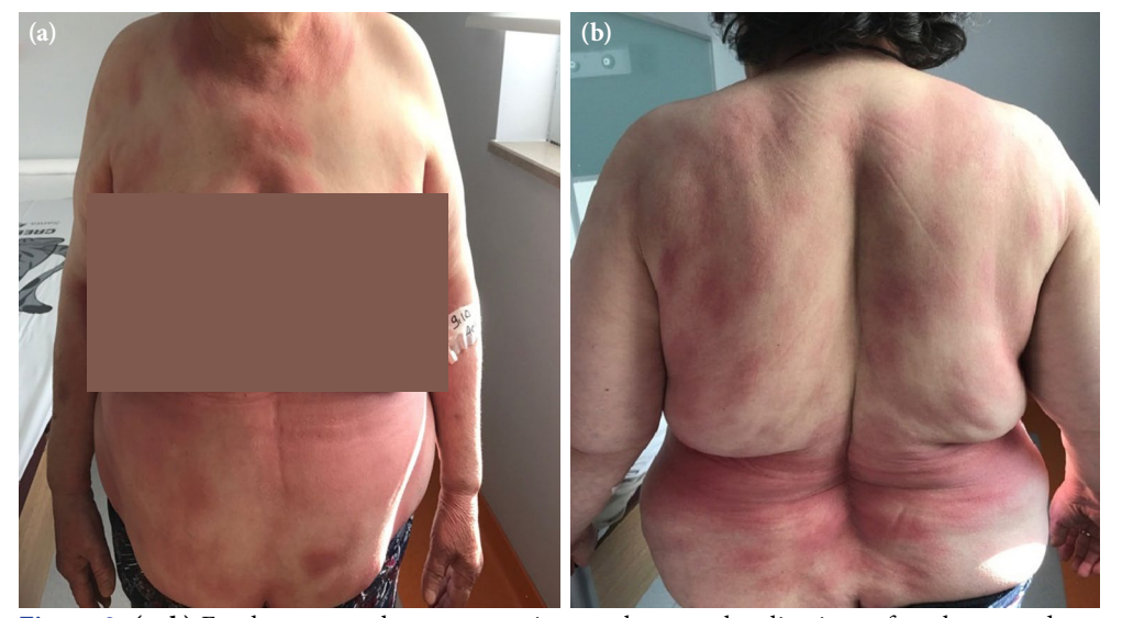
Figure 2. (a, b) Erythematous plaques occurring on the same localizations after the second use of gabapentin.

Histopathological features of classical FDE include hydropic degeneration of the epidermal basal cell layer, dyskeratotic cells in the epidermis, and a lymphocytic infiltrate in the upper dermis. <sup>[8]</sup> The histopathology of the present case showed a mixed type of inflammatory