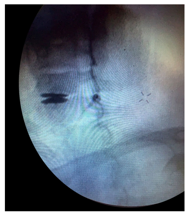
Figure 1. The spinal needle appears to remain inferior to the C7 foramen and posterior to the ideal location.

detected in the right upper and lower extremities, and right-sided hypoesthesia was detected. No deficit was detected in the left-side muscle strength and sensory examination. The patient's deep tendon reflexes were evaluated as normoactive, and pathological reflexes (Hoffman and Babinski signs) were not found. It is well documented that reflexes can be preserved in spinal cord injuries, and pathological reflexes sometimes do not occur.<sup>[4]</sup> In addition, the weak response in the lower extremity to painful stimuli led us to doubt the diagnosis of SCI/ischemia. The patient complained of severe neck and back pain. Her blood pressure was 85/50 mmHg, and the pulse was 70/min. Urgently, 1,000 mL of saline 0.9% (isotonic saline solution) was given intravenously. Cervical magnetic resonance imaging (MRI) and brain diffusion MRI were performed. In addition, vertebral and carotid system computed tomography angiography was carried out. No pathology was detected in the imaging studies. Considering the possibility of malingering, a psychiatry consultation was indicated. The patient was receiving quetiapine 200 mg and duloxetine 60 mg per day for major