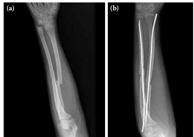
Figure 1. (a) Preoperative and (b) postoperative X-rays showing radius and ulna fractures.

In the treatment, a neurolysis/exploration is required in case of any entrapment. Although similar cases have been reported in the literature, it is difficult to uniform treatment (as surgical indications, the time of surgery time, etc.). [1,2] To the best of our knowledge, the role of musculoskeletal ultrasound in the previous cases has not been highlighted. Accordingly, with the presented case, we would like to highlight that ultrasound is a