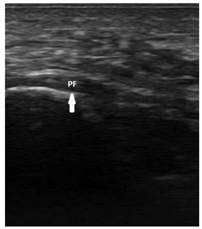
Figure 2. An ultrasound image of plantar fascia.