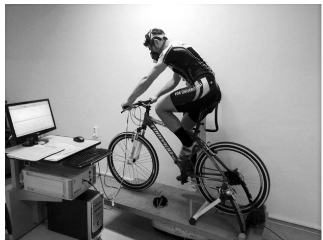
Figure 2. Placement of the system on a platform fixed to whole body vibration equipment.

The VO 2 , VCO 2 , VE, and RER were monitored, breath-by-breath during all tests, using a standard gas analyzer (Quark b2; Cosmed Srl., Rome, Italy). Data were smoothed over every five-point interval and interpolated every 30 sec to eliminate outlying data. The VO 2 (mL·min -1 ·kg -1 ) gas analyzer was calibrated according to the manufacturer's instruction. The HR was continuously recorded using a HR monitor system (Garmin EDGE 1000, Garmin International Inc., KS, USA). The GE (%) was calculated as the ratio of mechanical power-to-metabolic power. Mechanical power (P mec ) was evaluated from the wattage and the rpm (Eq.1), while metabolic power (P met ) was