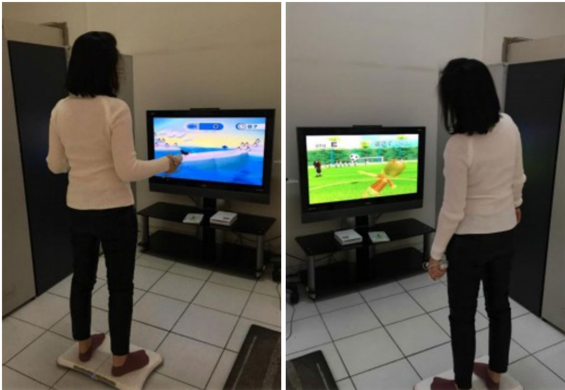
Figure 2. Virtual reality therapy.