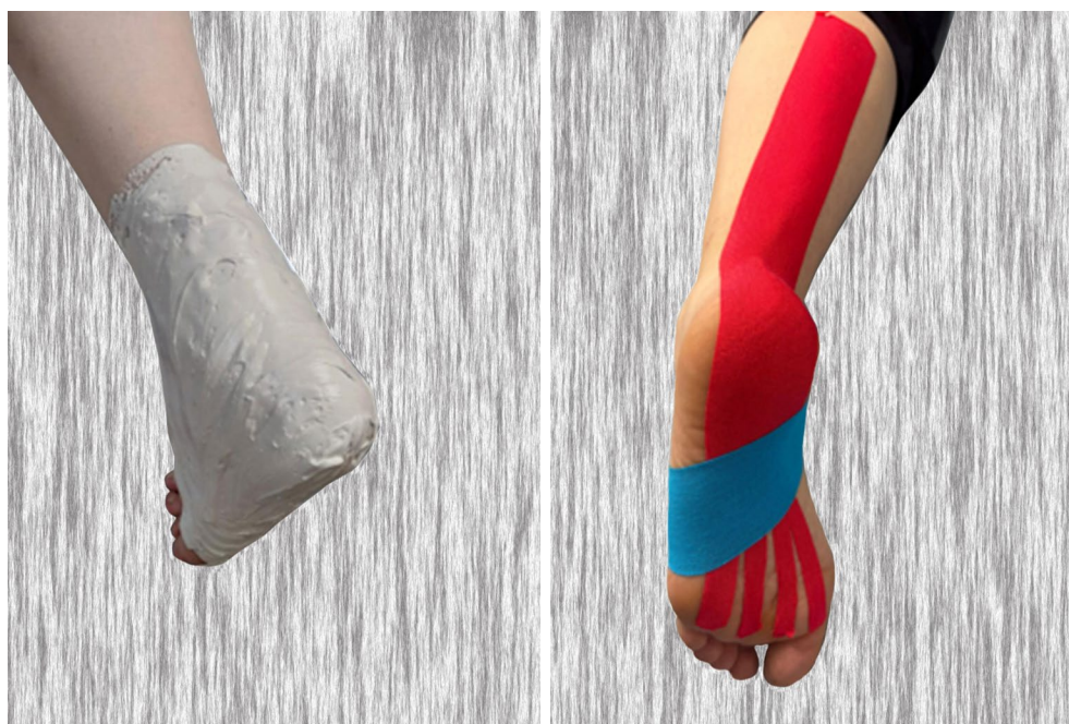
Figure 1. Peloid therapy and kinesiotaping applications.

A home-based exercise program and a prefabricated silicone heel pad were given to the control group. As exercises, plantar fascia stretching, Achilles tendon stretching, and calf stretching (two times per day, five repetitions for 30 sec each time), and plantar flexor and intrinsic muscle strengthening (double heel raise and towel curl exercises, two times per day, 10 repetitions each time) were given every day for six weeks. These same exercises were demonstrated practically by a physician, and a printed document describing the exercises visually was given to all patients. Participants with a compliance rate of less than 75% to the home-based exercise program and insole use were excluded from the study.