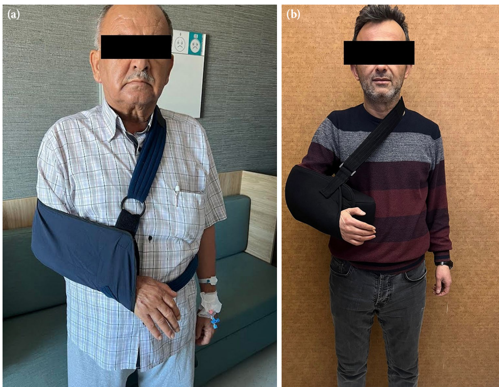
Figure 1. (a) Sling bandages with no pillow. (b) Sling bandages with an abduction pillow.

Patients were randomly separated into three groups using an online randomization software ( http://www.graphpad.com/quickcalcs/index.cfm ). The patients in the nonsling group (n=28) wore no sling, those in the sling group (n=32) wore sling